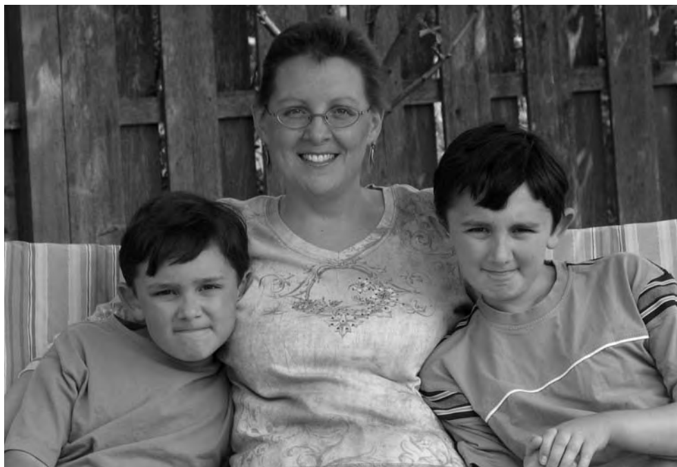
Once a cancer patient; now a cancer survivor.