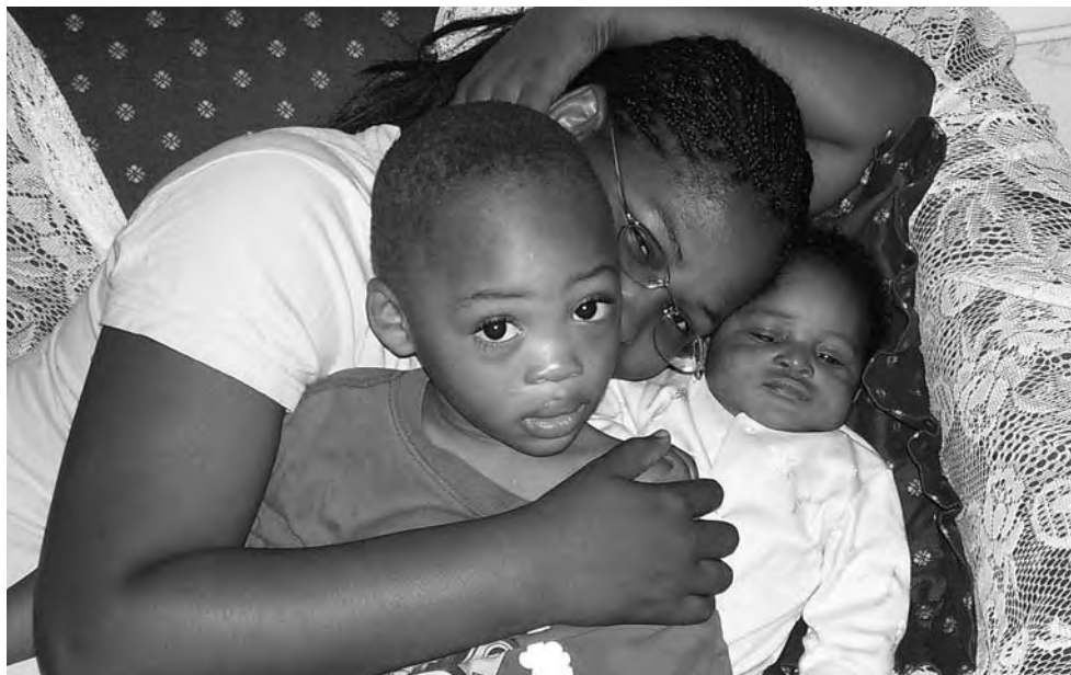
The Y has offered pre- and post-natal care since 1986.

Their parents and members of the Greater LaGrange YMCA, have introduced their boys to swimming through the Y, but the boys have found more than lessons at their pool.